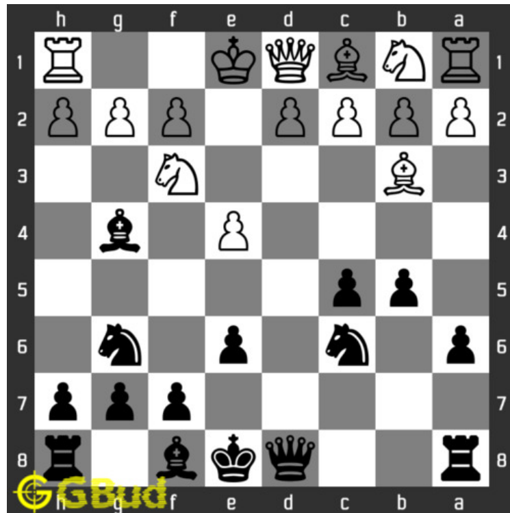
Figure 1.1: Solve this easy chess puzzle 0012. Sacrifice a piece to gain queen @ https://gbud.in/glfgt01