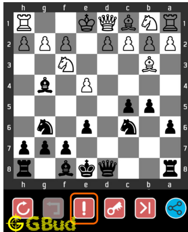
Figure 1.4: Click the help button to get help on next move @ https://gbud.in/glfgt01